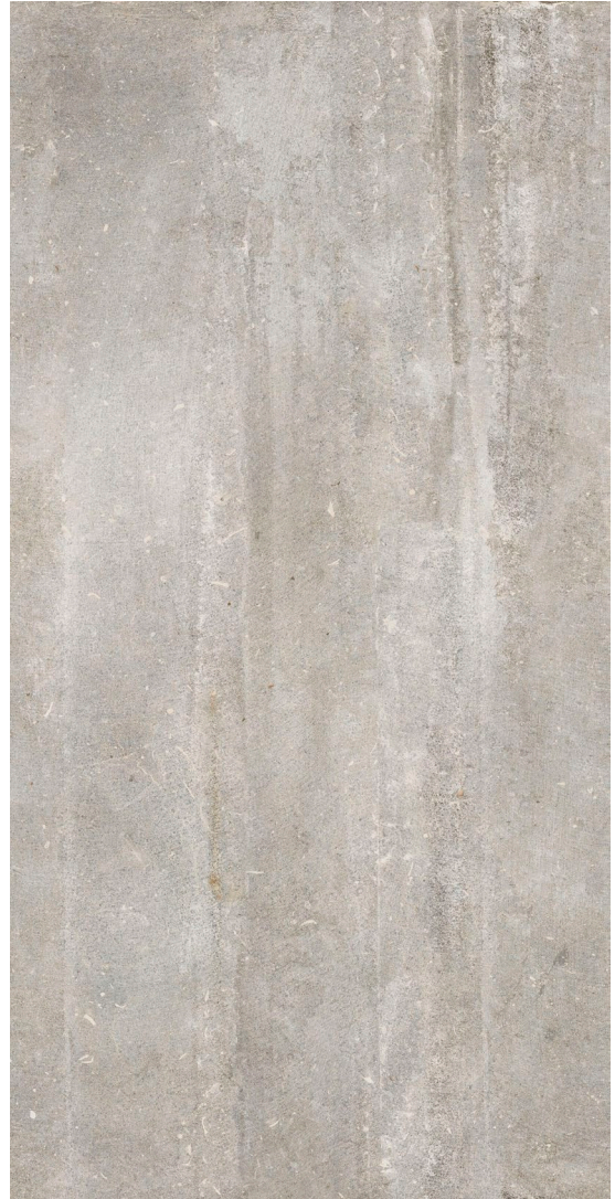
GREIGE (Grey) Matte Finish