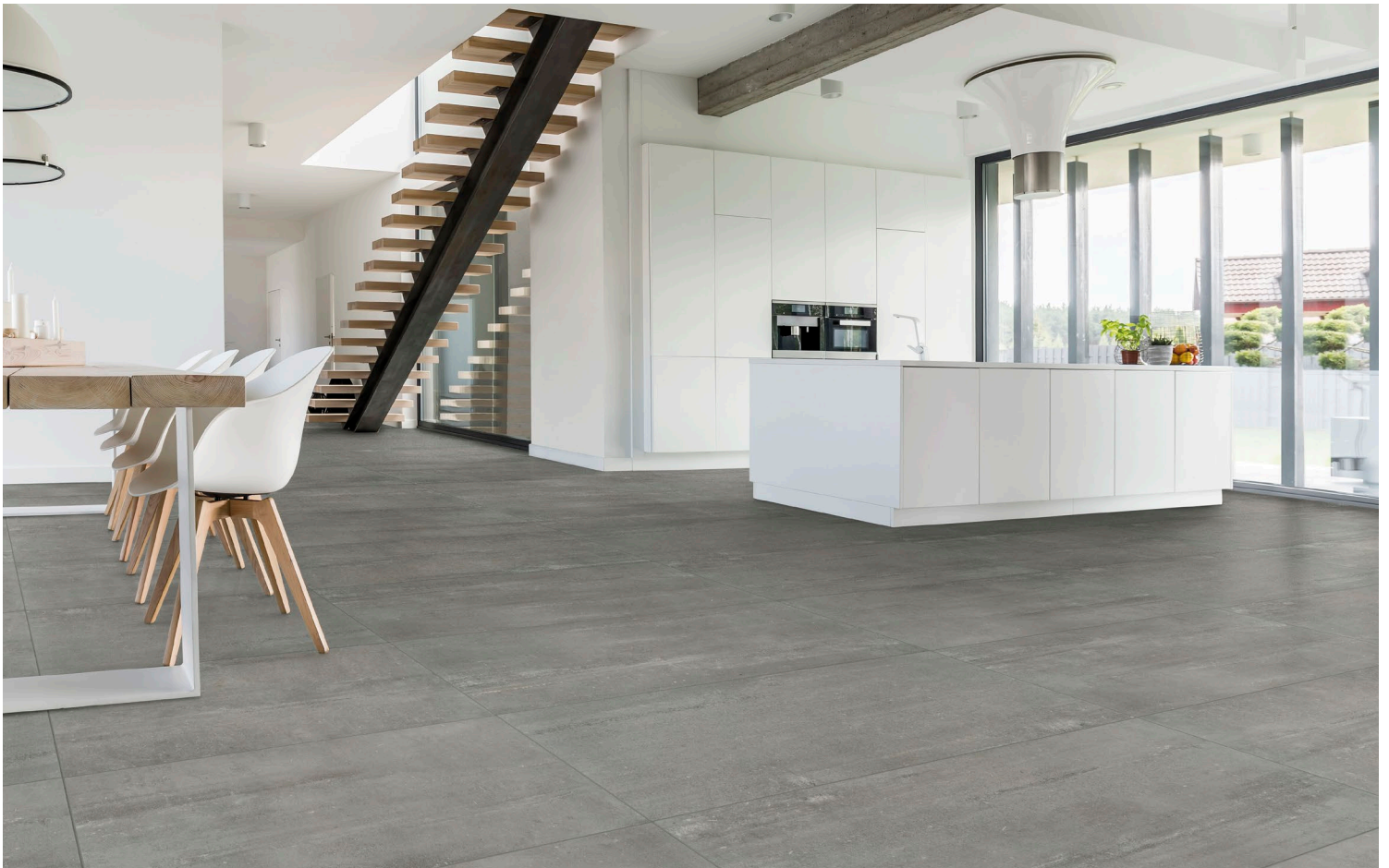
FUMO (Light Grey)