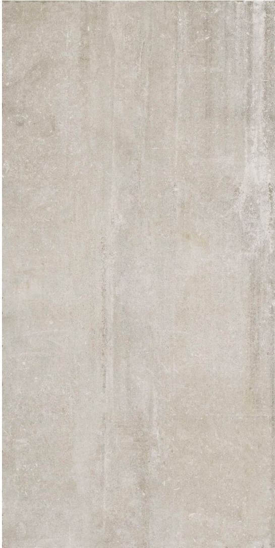
GHIACCIO (White) Matte Finish